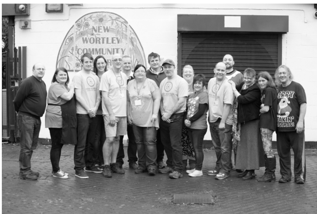
Figure 3. NWCA

The NWCA volunteers are called Team New Wortley; it is a diverse assembly with varying intentions and agendas, unified in their requirement for stability and a purpose enabling them to move forward. Some individuals have learning difficulties and thus see NWCA as a long-term supporter providing a safe and secure environment outside of their own home. Others are recovering from illness or addiction and use NWCA as a springboard to obtaining employment, some are retired and stave social isolation by integration. A growing number have full time employment but care so deeply about their Community of Place's continued improvement they offer their free time willingly. Thus, at the core of this liveable urbanity sits an enclave which shelters, feeds, upskills, and ultimately empowers its members to the benefit of the Community of Place. This is the crux, exemplified by the social impact statistics.