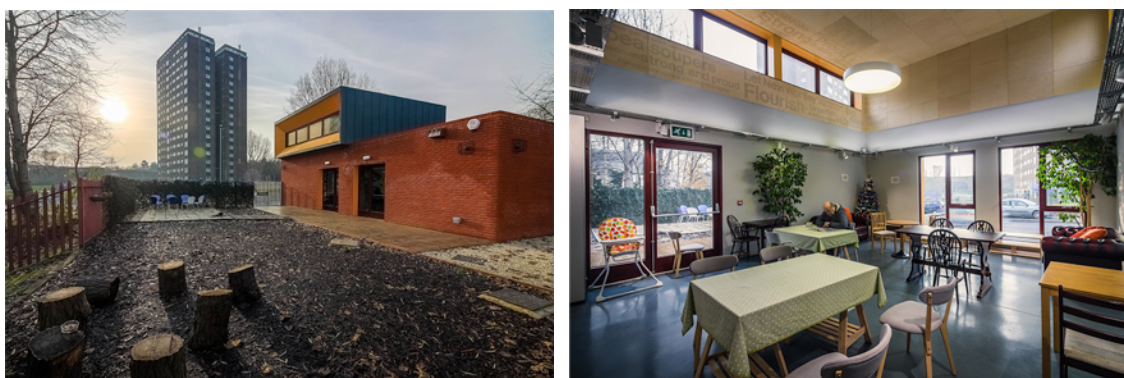
Figure 11. New Wortley Community Centre

The final lesson to be learnt sees NWCA a victim of their own success. In the range of services now offered a number have become so popular advance booking is required, potentially alienating the very people they are designed to serve. The prisoner greeting scheme has outgrown the space available entirely, requiring NWCA to now hire additional offices. Whilst to be celebrated in one regard, these issues raise serious questions relating to the actual possibility of achieving what NWCA aspire to – reaching everyone within the Community of Place. Thus, whilst the existing building will receive a facelift and a small increase in space in autumn 2017, funding is now being sought to at least double the current footprint. The continued influence of NWCA, and impact on the liveable future of the Community of Place, requires it to be found.