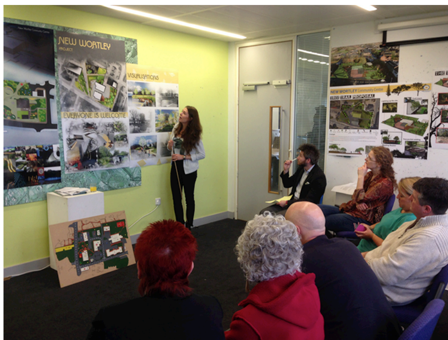
Figure 10. Landscape design presentation

When considering finances, the café has not performed as successfully as other aspects of NWCA's business model, probably due to an architectural error in the co-design process. For security, the new community centre building has one entrance requiring all guests to sign in, from here one may transition into the café. Passing footfall wishing to purchase a coffee are unlikely to undertake the process, thus the café should have been separately accessed. With redevelopment of the existing building a potential future phase, this is an element to address.