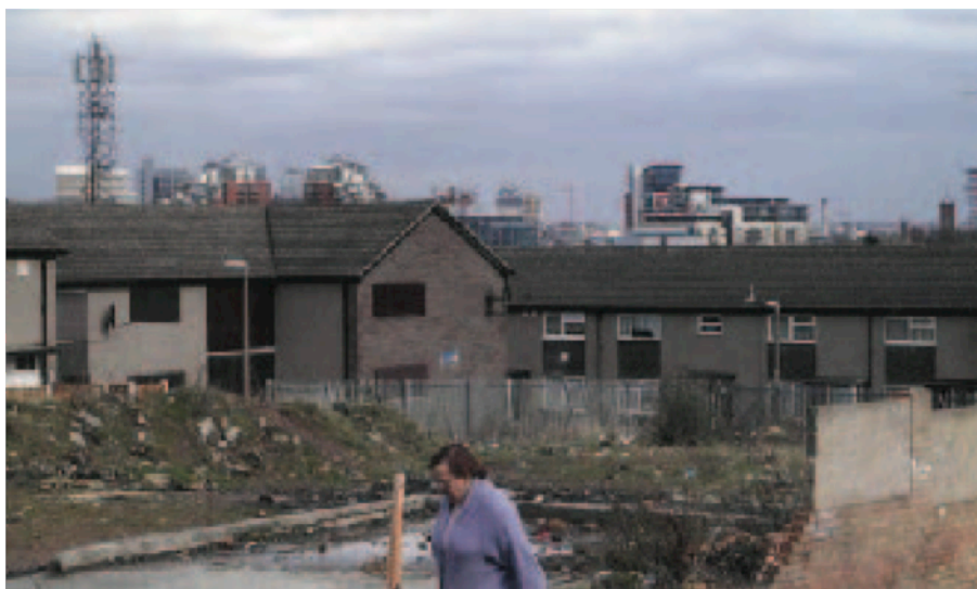
Figure 1. New Wortley, Leeds (Irena Bauman)

New Wortley, an inner-city suburb of southwest Leeds is the city's most impoverished with 34% of people claiming out of work benefits. Rows of red brick back-to-back terrace housing were collapsed into their basement in the 1960's slum clearance. In their place, a Radburn design estate of poor quality semi-detached and adjacent high-rise dwellings were erected. The traditional high street has been slowly eroded by legislative moves and piecemeal demolition. Today New Wortley has little urban quality or identity to be proud of or relate to, it is a harsh and disconnected physical environment. This is matched by the social situation where the needle exchange at the pharmacy next door to New Wortley Community Centre (NWCC) is the most heavily used in Leeds. Coupled with the highest suicide rate in the city, New Wortley has an average life expectancy of just fifty years of age.